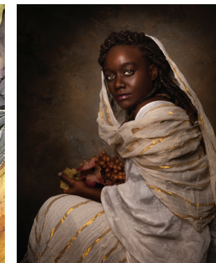
Green Eyed Lady by Kimberly Oakley 1st Place Photography 2023 Still Hopes Exhibit

We believe bringing art into a community strengthens it in innumerable ways.